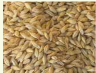
W313 BARLEY, RYE AND SMALL-GRAIN RICE