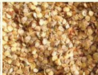
W308 FLESHY GARDEN VEGETABLES

The Trinium method covers the entire cycle of the plant, from seed to harvest. We recommend that you keep your own seed to ensure maximum quality and yield.