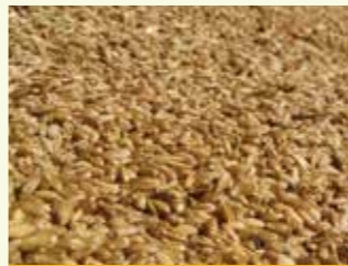
W314 SORGHUM AND MILLET