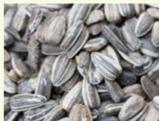
W305 OILSEED CROPS