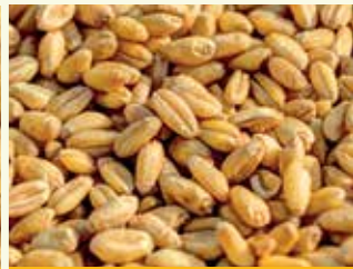
W317 DURUM WHEAT