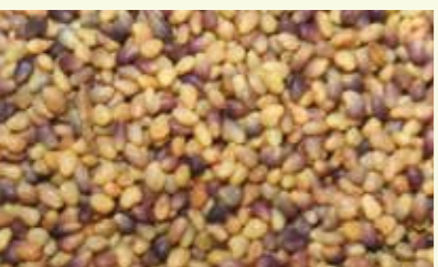
W300 LEGUMES FOR GRAZING