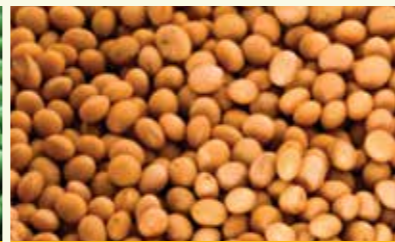
W312 CHICKPEAS, LUPINS, SOYA AND LENTILS