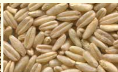
W303 WHEAT, OATS AND LARGE-GRAIN RICE