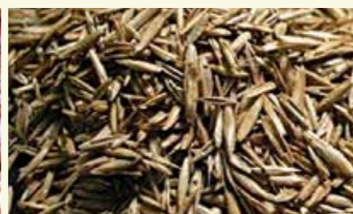
W302 GRASSES FOR GRAZING