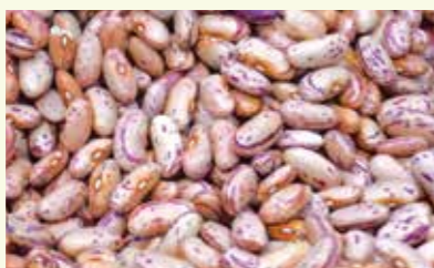
W301 BEANS, FIELD PEAS AND BEANS