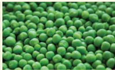
W311 COOKING PEAS