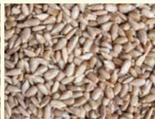
W307 LEAF VEGETABLES