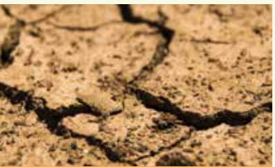
W309 DRYLAND FARMING