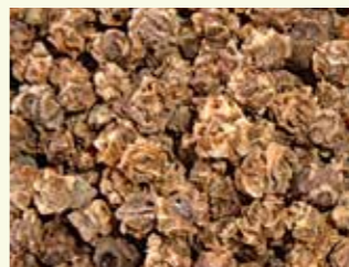
W306 ROOT VEGETABLES