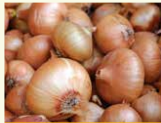
W315 GARLIC AND ONIONS