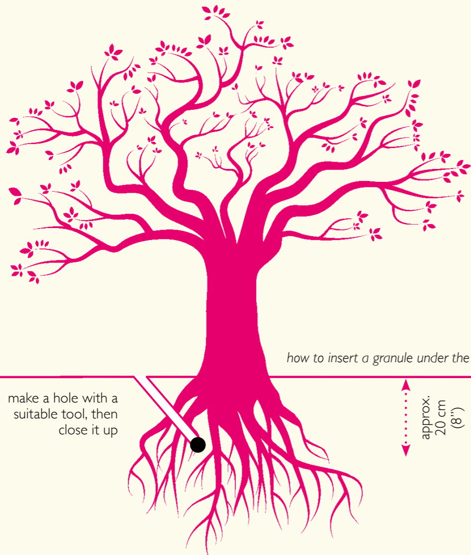
how to insert a granule under the plant

make a hole with a suitable tool, then close it up